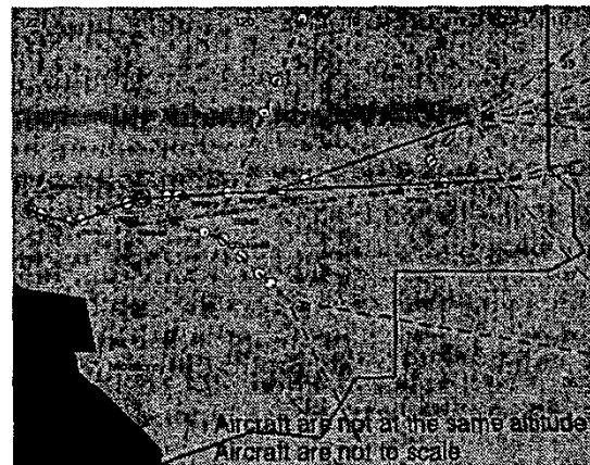
Figure 1: Two examples of arrival into the Oakland airport: Madwin 3 (—) and Locke 1 (---).

complexity of air traffic flow in the vicinity of large airports. Besides helping to reduce the workload of the Controllers, this advisory system also contributes to a more efficient traffic flow management which benefits the passengers and the airlines, by reducing the delays and improving safety. The functionalities covered by CTAS and other tools available to the Air Traffic Controllers include monitoring, alerts, advisories, some planning functionality, as well as information displays. With regard to planning, CTAS can be used to assign aircraft to particular arrival routes, called arrivals , into airport vicinities (see Figure 1 for two main arrival routes into Oakland airport).